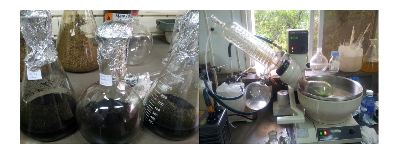
Plate 3.1: Preparation of plant extracts

Crude extracts from the stored fine powder were prepared using hot water and methanol. The crude extracts were later to be reconstituted to attain the desired concentration was constituted by dissolving 50 g of the ground samples with 100 ml of each of the respective solvents (Plate 3.1) (Usman and Osuji, 2008).