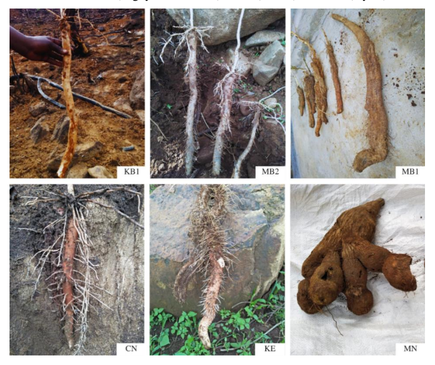
Plate 3: Wild Yam, Dioscorea schimperiana Kunth (KE1, CN, MB2, KB1 and MB1) and D. alata (MN) Underground Tubers Collected in situ