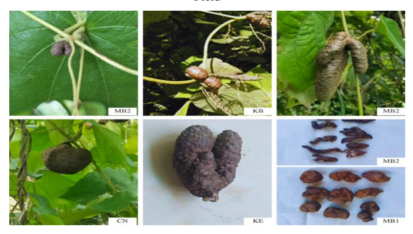
Figure 520: Wild Yam Bulbils Formed by D. schimperiana Plants in situ in Different Counties; MB2 and MB1 (Baringo), KE (Elgeyo-Marakwet), CN (Nandi).