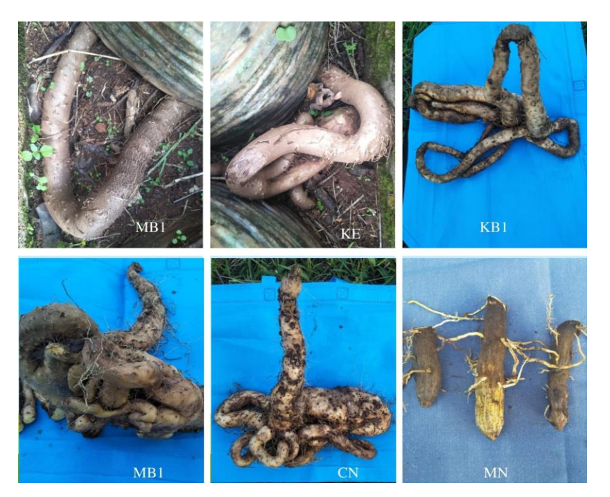
Plate 2: Extracted root tubers of net-house grown yam accessions, MB1 and KB1 (Baringo), KEa and TE (Elgeyo-Marakwet), CNa (Nandi) and MN (Nyeri)