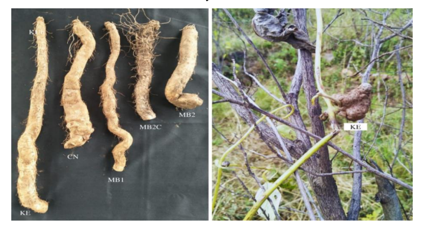
Plate 4: Harvested Tubers of the Field Grown D. schimperiana Accessions (KE, CN, MB1, MB2), control (MB2C), and D. schimperiana Bulbils Produced by Accession KE in the Field

Values with the same letter(s) in a column are not significantly different at P \leq 0.05 , according to Tukey's test.