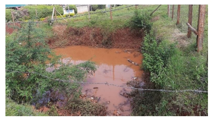
Figure 15: A detention pond near Amalemba Primary School in the study area.

Figure 3 illustrates a detention pond dug around Amalemba Primary School a higher ground of the settlement by Amalemba informal urban settlement residents to control runoff.