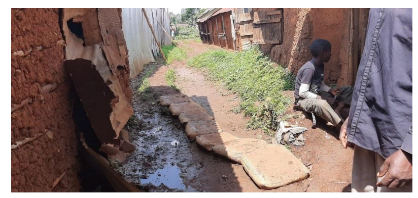
Figure 19: Used cement bags filled with soil to control runoff.

settlement. Cement bags were used to form a retaining wall as well as act as footpath through the settlement (Figure 7). The footpath was used to prevent runoff from flooding the shacks as well as act as an obstacle to runoff, so that the cultivated area would not be flooded with water. As observed by one of the residents, these measures were overwhelmed by high volume of runoff that was generated in the informal settlement.