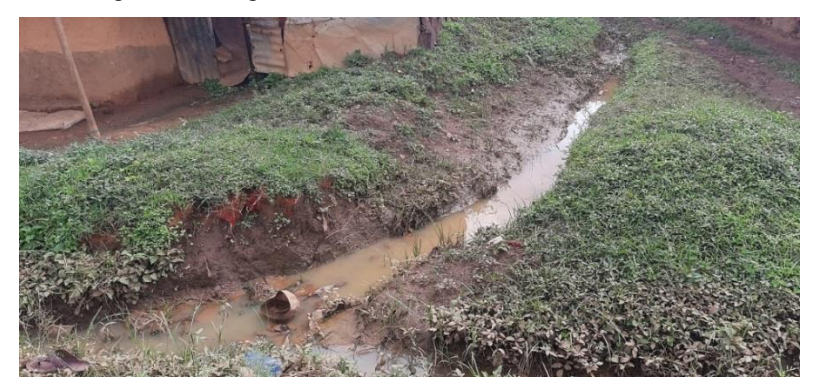
Figure 16: Open drains in Amalemba informal urban settlement.

...the vegetated drains reduce the time it takes runoff to reach the receiving stream by slowing velocity of runoff and providing some infiltration. Open drains also provides a low cost alternative to enclosed pipe system which offers some water quality benefits if properly designed (County Engineer, personal communication, 2020).