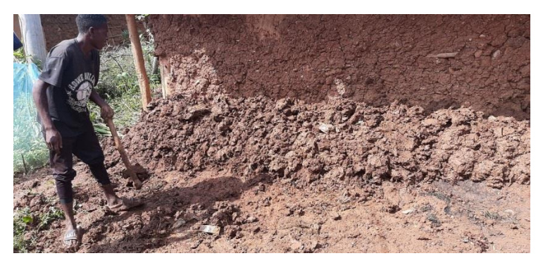
Figure 18: Heaping mud on shack base for stability.

To avoid runoff infiltration into the shack through the base of the walls, most of the residents strengthened the wall base of their shacks seasonally by heaping laterite or mud against the wall base (Figure 6) or packing stones and hard substances to reinforce the wall base.