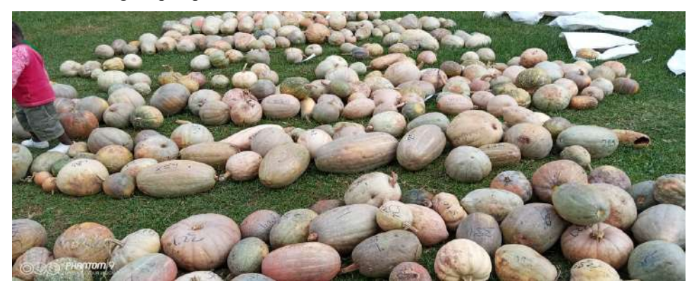
Figure 5: Pumpkin fruits harvested at Eldama Ravine.

were varied in size, shape, colour and ribbing as seen in Figure 1.