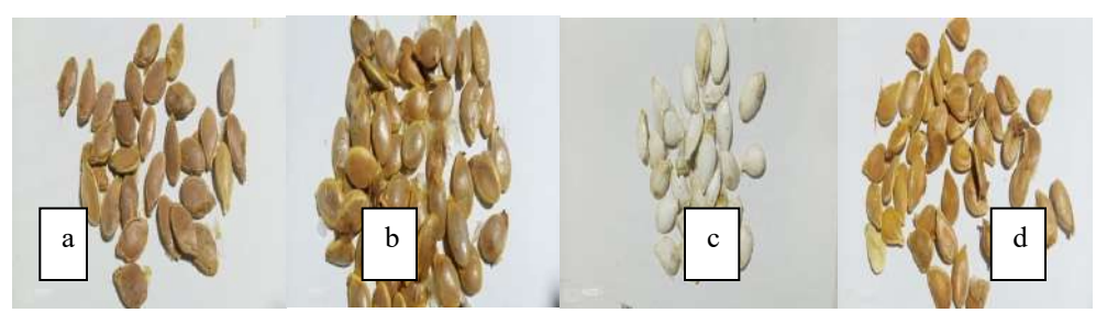
Figure 8: Samples of dried seeds used for nutritional and phytochemical analyses.

The seeds used in the study varied in size, colour, glossiness and shape as shown in figure 4a-d.