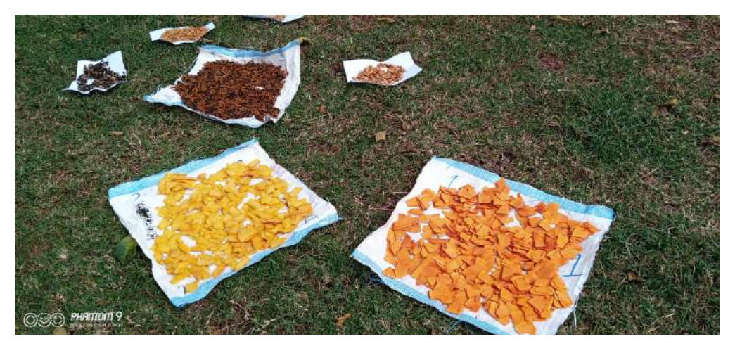
Figure 7: Sun drying of grated pumpkin.

The seeds used in the study varied in size, colour, glossiness and shape as shown in figure 4a-d.