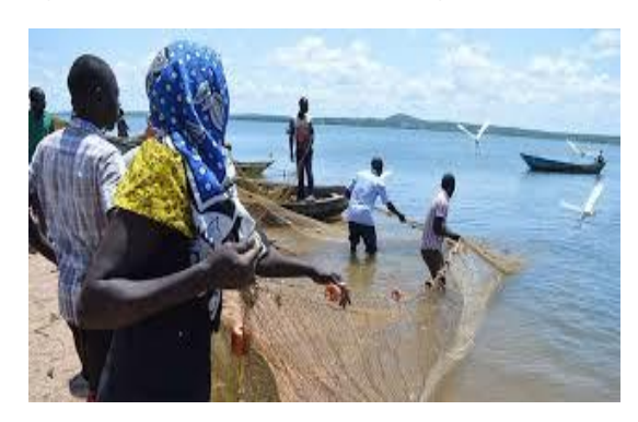
Figure 2: Prior to and following the invasion, respectively, in Nyanza Gulf (October 2018).

1989, the weed had spread to all of the neighbouring water bodies covering up to 20,000 ha, raising public concerns (Simiyu et al., 2022). Its rapid growth in Lake Victoria increased by 3 hectares per day (Karouach et al., 2022), attributed to the presence of high nutrients, high reproductive ability and longevity in seed viability and a dearth of competitors in the same environment (Dagno et al., 2012).