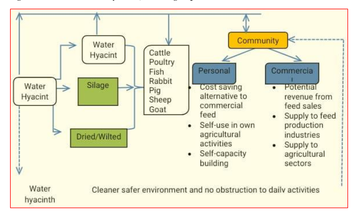
Figure 7: Benefits of water hyacinth, including its possible use as animal feed