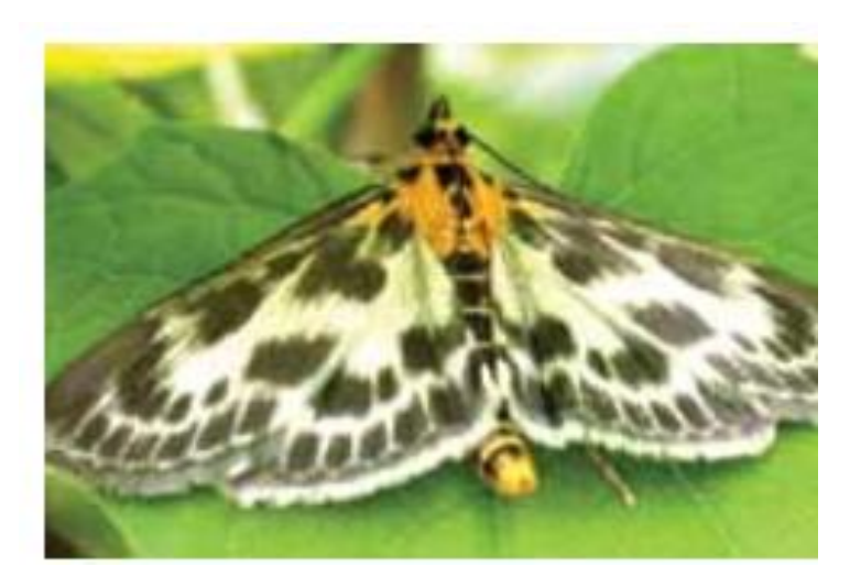
Figure 6: A pyralid moth: Niphograpta albiguttalis