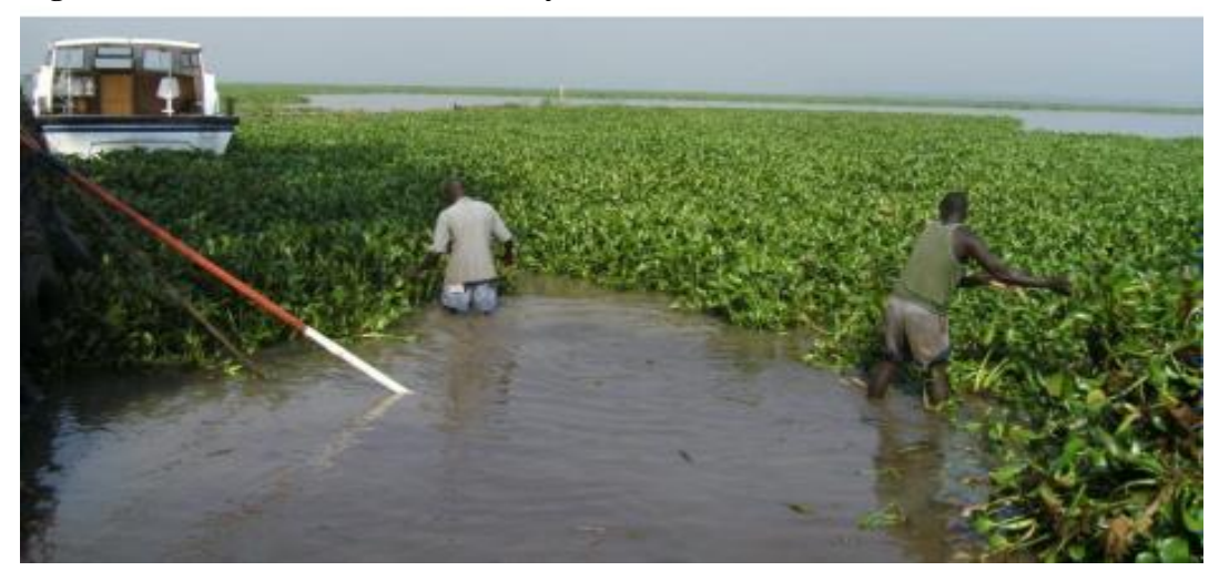
Figure 4: Manual removal of Water hyacinth in Lake Victoria.