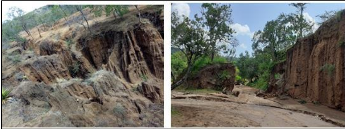
Plate 1: Two types of gullies based on continuity channel, a) braided channels with earth pillars and b) continuous channels with parallel banks