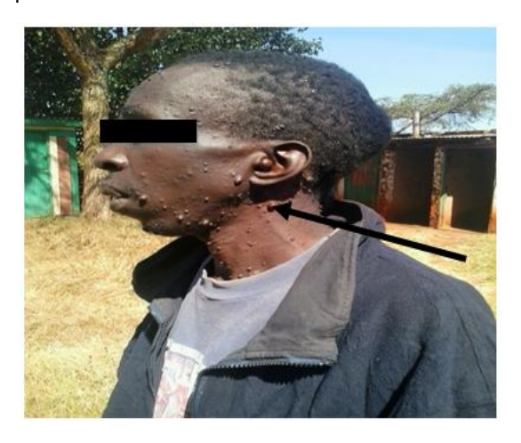
Plate 1. The Kwanza case of L. aethiopica infection showing nodules on the face and upper body (arrow)

Since Phlebotomus pedifer were caught in the peri-urban areas where Leishmania aethiopica cases were, it can be concluded that transmission is actively going on in these sites. Sand flies even though were caught in small numbers during and after the rainy season, in the same sites; the sand flies breed and rest in these sites where disease transmission takes place. It is yet to be known when transmission takes place.