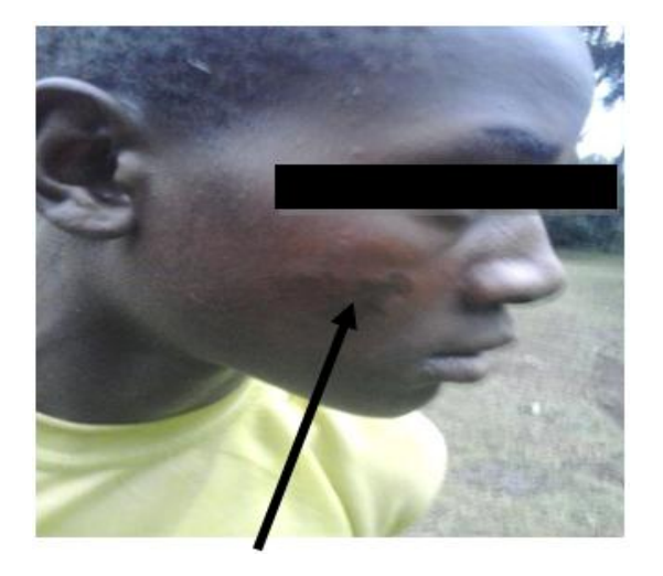
Plate 2. Kimkung L. Aethiopica infection with fresh developing nodules (arrow)

The spread of Leishmaniases is always determined by the presence of the vector and a human or animal reservoir host [18], In the absence of a known reservoir host, apart from what has been reported in Chemai, it is possible that the disease could be evolving from zoonotic