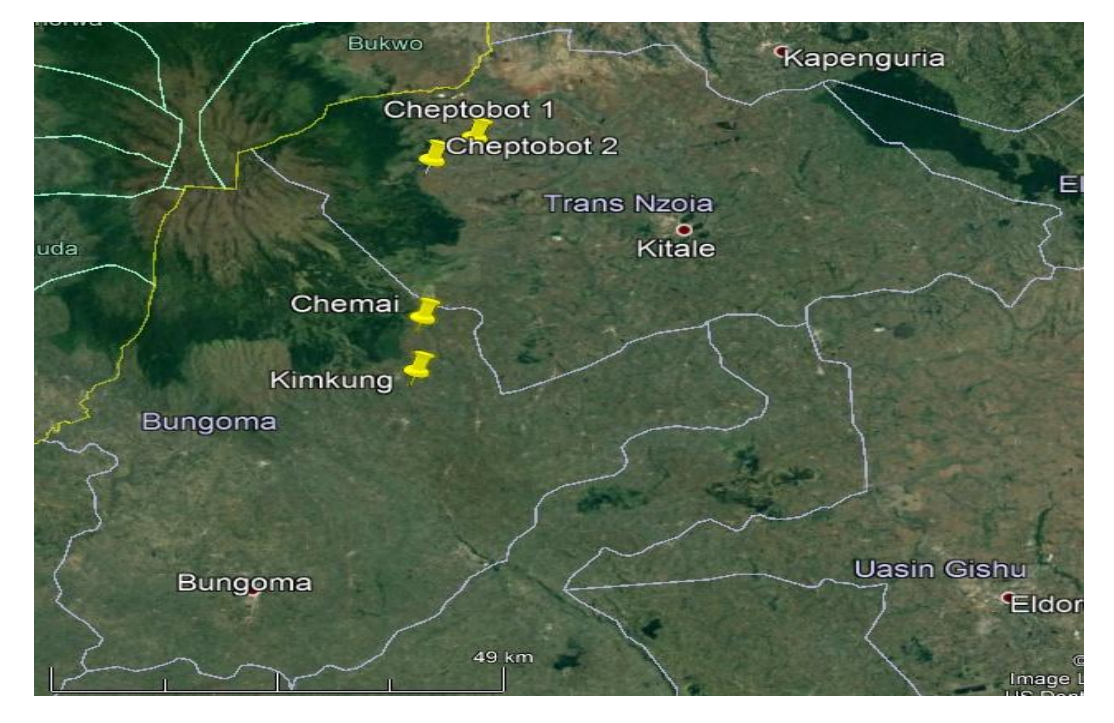
Fig. 1. Map of Bungoma and Trans-Nzoia County showing the position of the sampling sites

Sand flies were preserved in 70% ethanol in the field. Specimens were cleared, dissected and permanently mounted on microscope slides and examined using a Nikon Eclipse 50i compound microscope equipped with phase contrast. Drawings were made with the aid of a Nikon Y-IDT drawing tube and digitally processed using Corel Photo Paint X3 (Version 13). All specimens were deposited in the laboratory at the Kenya Medical Research Institute (KEMRI) in Nairobi. Abbreviations for genera and subgenera followed the proposal of [15]. Sand flies were identified by external morphology under a dissecting microscope and separated by sex before being counted. They were categorized by examination of the spermathecea (females) and the external genitalia (males) [16].